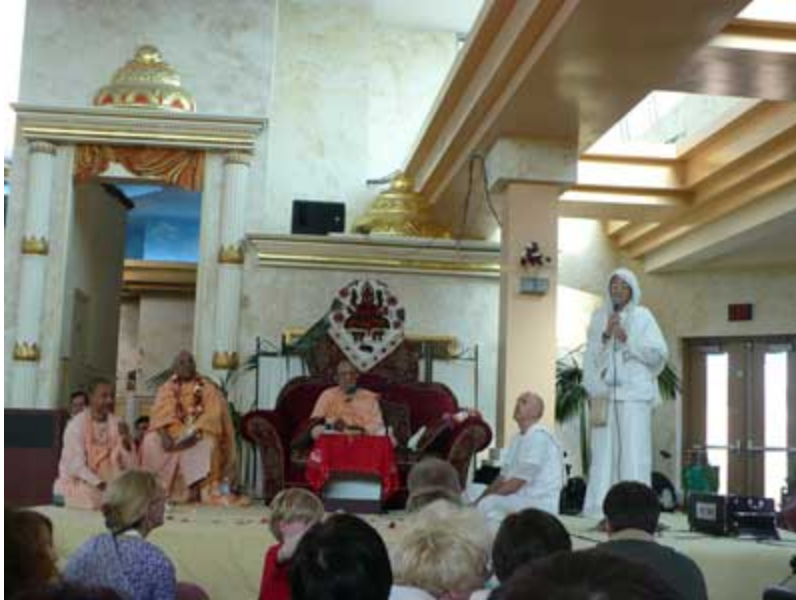
Program at the Hindu temple in Toronto

In this darsana, he spoke about his relationship with Srila Prabhupada Bhaktivedanta Swami Maharaja. He explained how Srila Prabhupada sent him to the West to help Prabhupada's disciples.