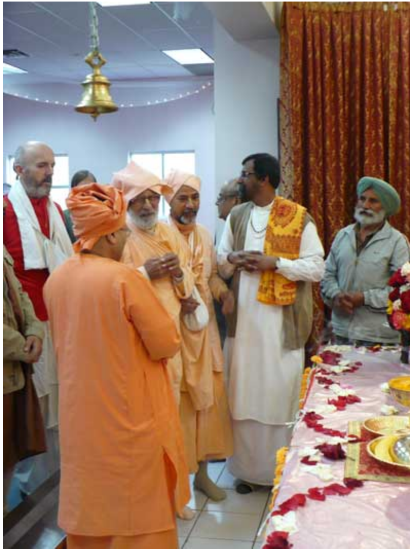
Greeted by the pujari and other staff at the Hindu Mandir