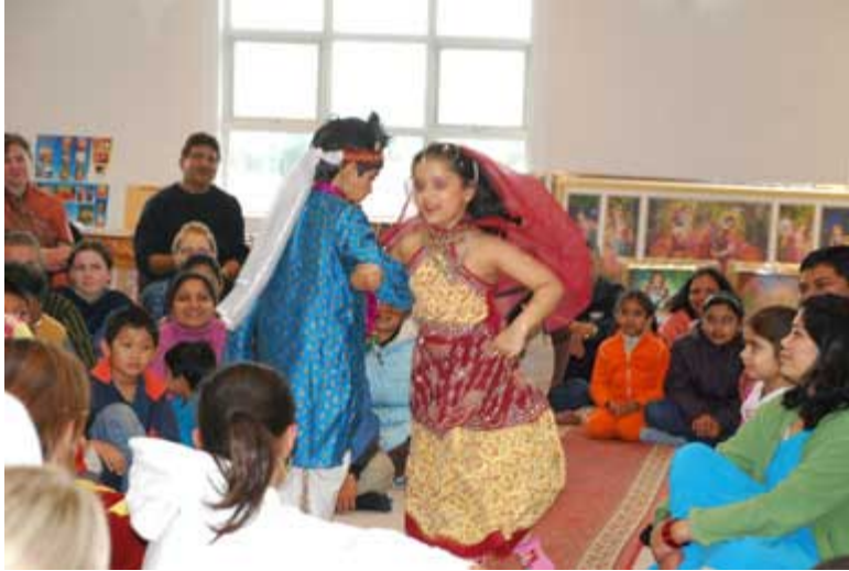
Dance performance by the children during the temple program.

Srimad-Bhagavatam, wherein the sages gathered in Naimisaranya and enquired from the great saint Sri Suta Gosvami about how the soul can be happy. He also clarified and elucidated the meaning of pure bhakti.