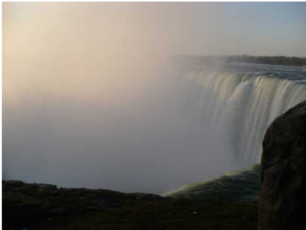
The living entities in the land, sea, and sky of Niagra Falls getting purified by the glance of the pure devotee, and by the atoms of prema emanating from the pores of his divine body. *[See endnote 2]

[*Endnote 1: “These verses were originally composed and sung by Ramananda Raya himself. Srila Bhaktivinoda Thakura suggests that during the time of conjugal enjoyment, the attachment might be compared to Cupid himself. However, during the period of separation, Cupid becomes a messenger of highly elevated love. This is called prema-vilasa-vivarta. When there is separation, conjugal enjoyment itself acts