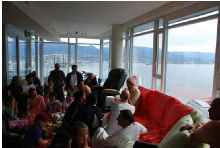
Darsana – just before giving initiation to about 20 devotees.

[To see the video of this discourse, please logon to www.purebhakti.tv .]