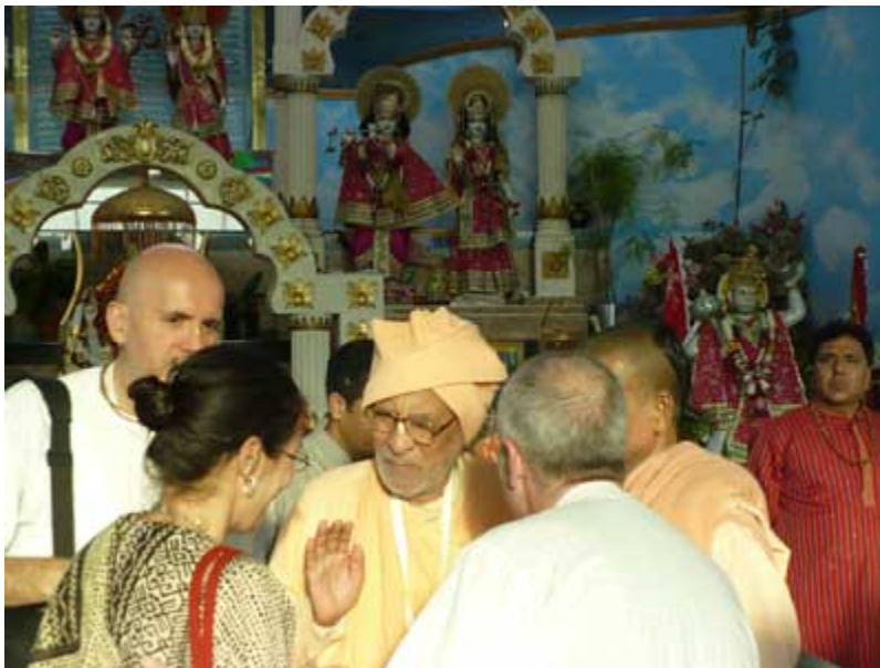
Offering blessings before leaving the temple