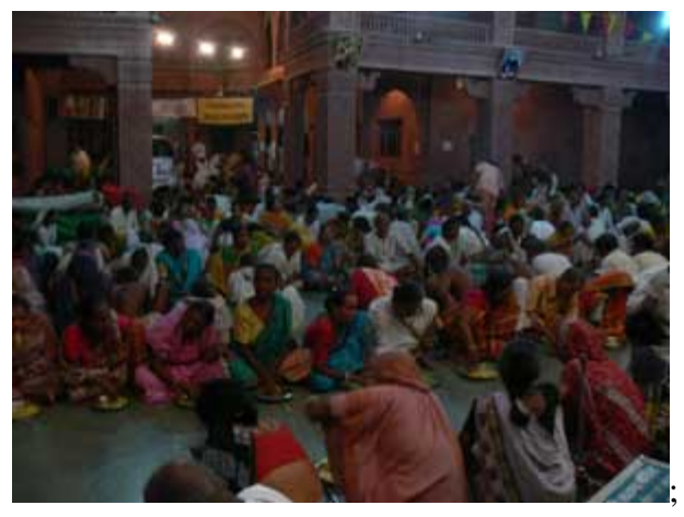
Honoring breakfast prasadam in the temple