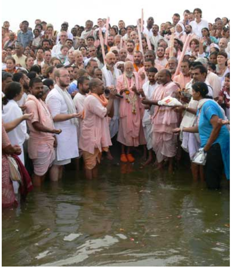
After the morning glorification, Srila Maharaja led the devotees to the Yamuna River to make their sankalpa (vow) for the month.