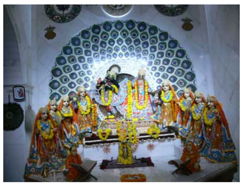
Sri Sri Radha-Krsna and the Asta-sakhis